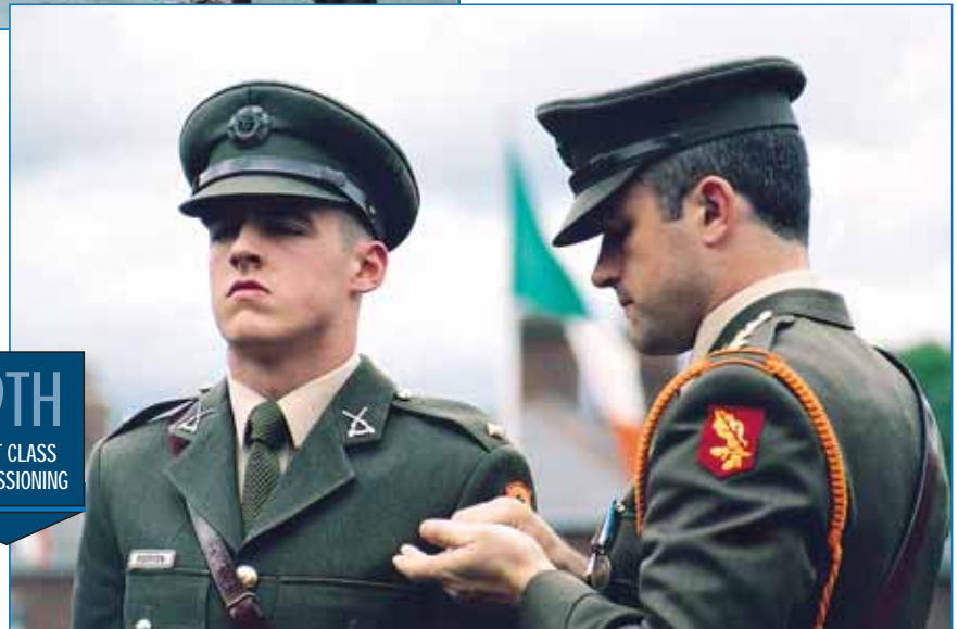
Guard of Honour from 80th CC